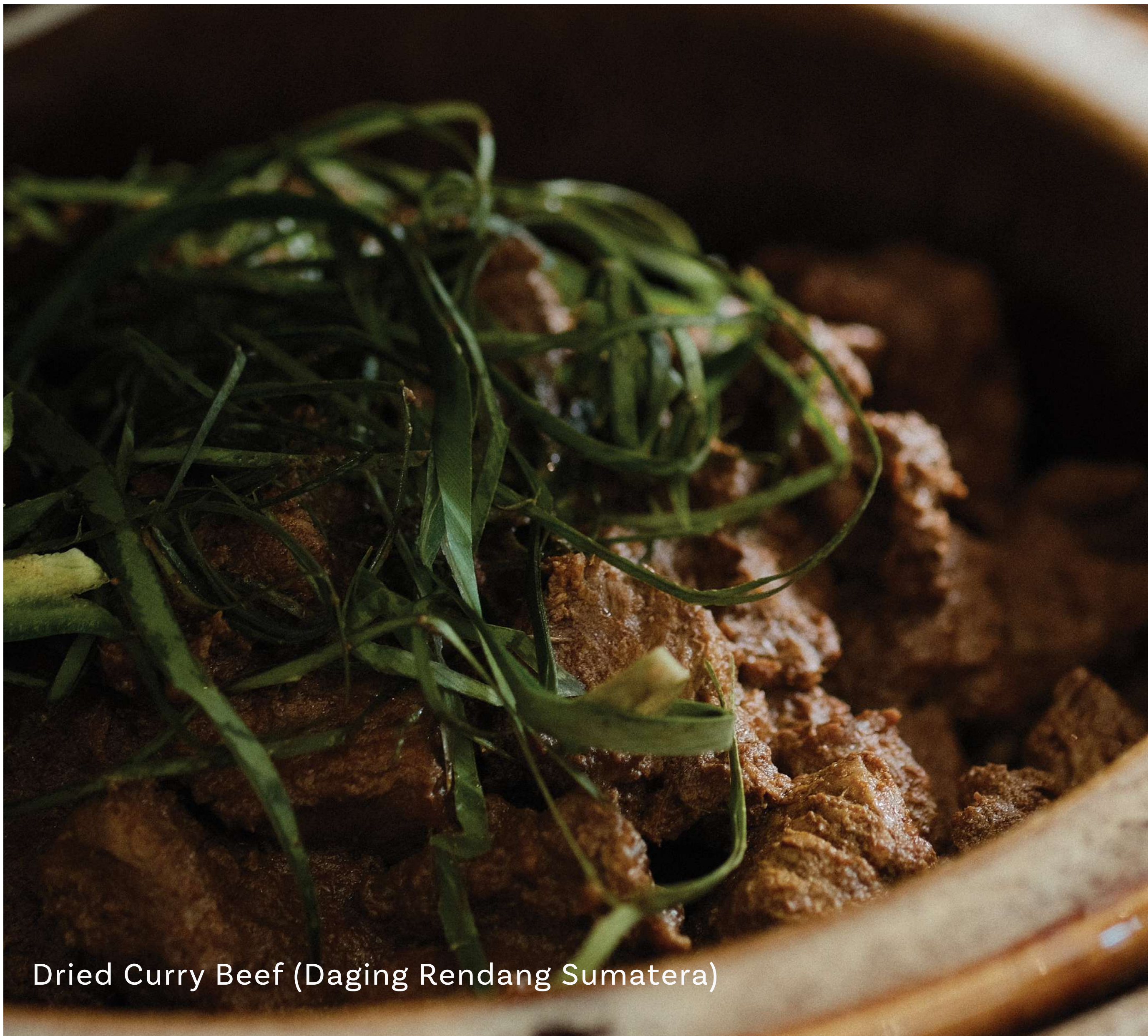
Dried Curry Beef (Daging Rendang Sumatera)