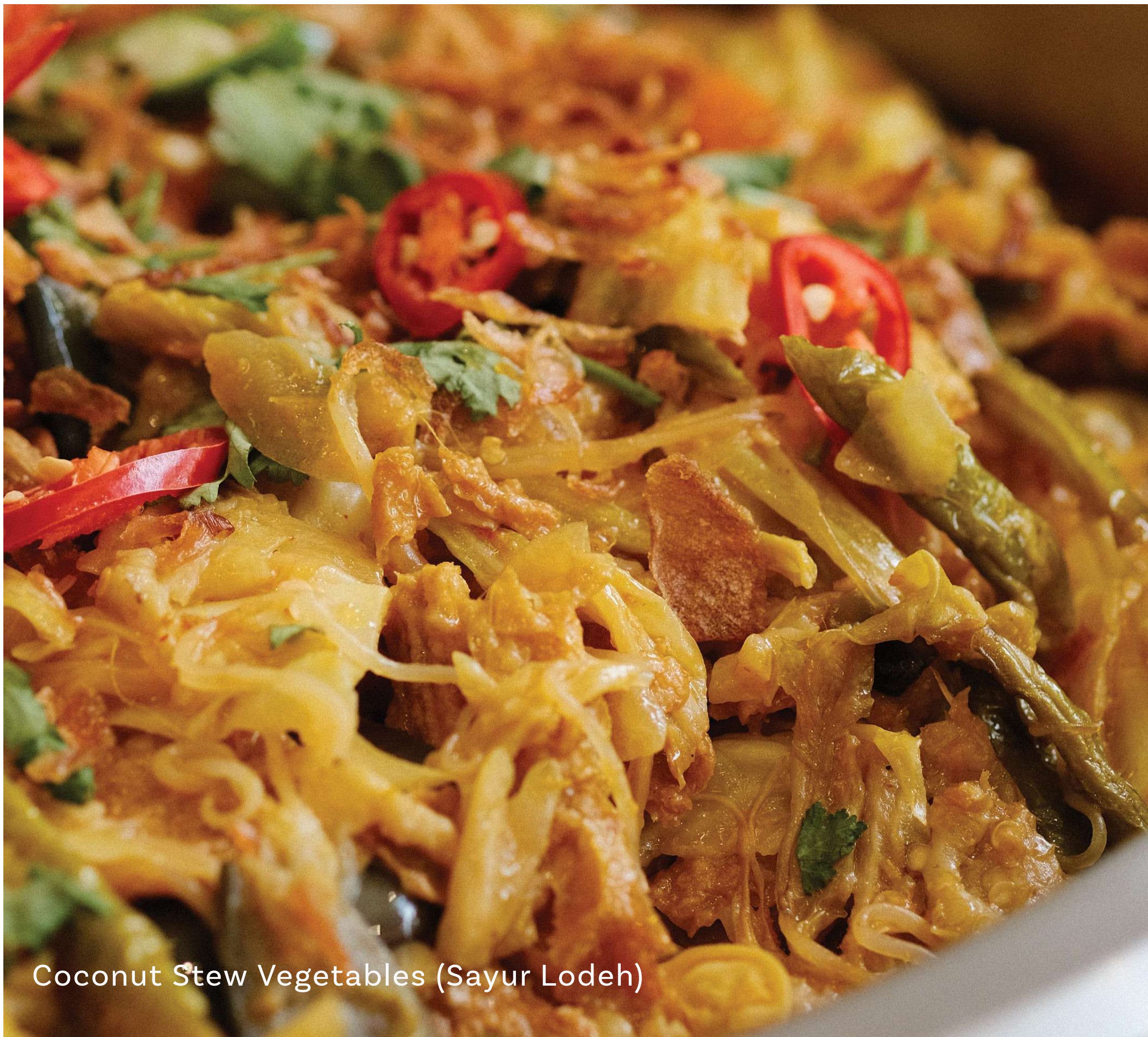
Coconut Stew Vegetables (Sayur Lodeh)