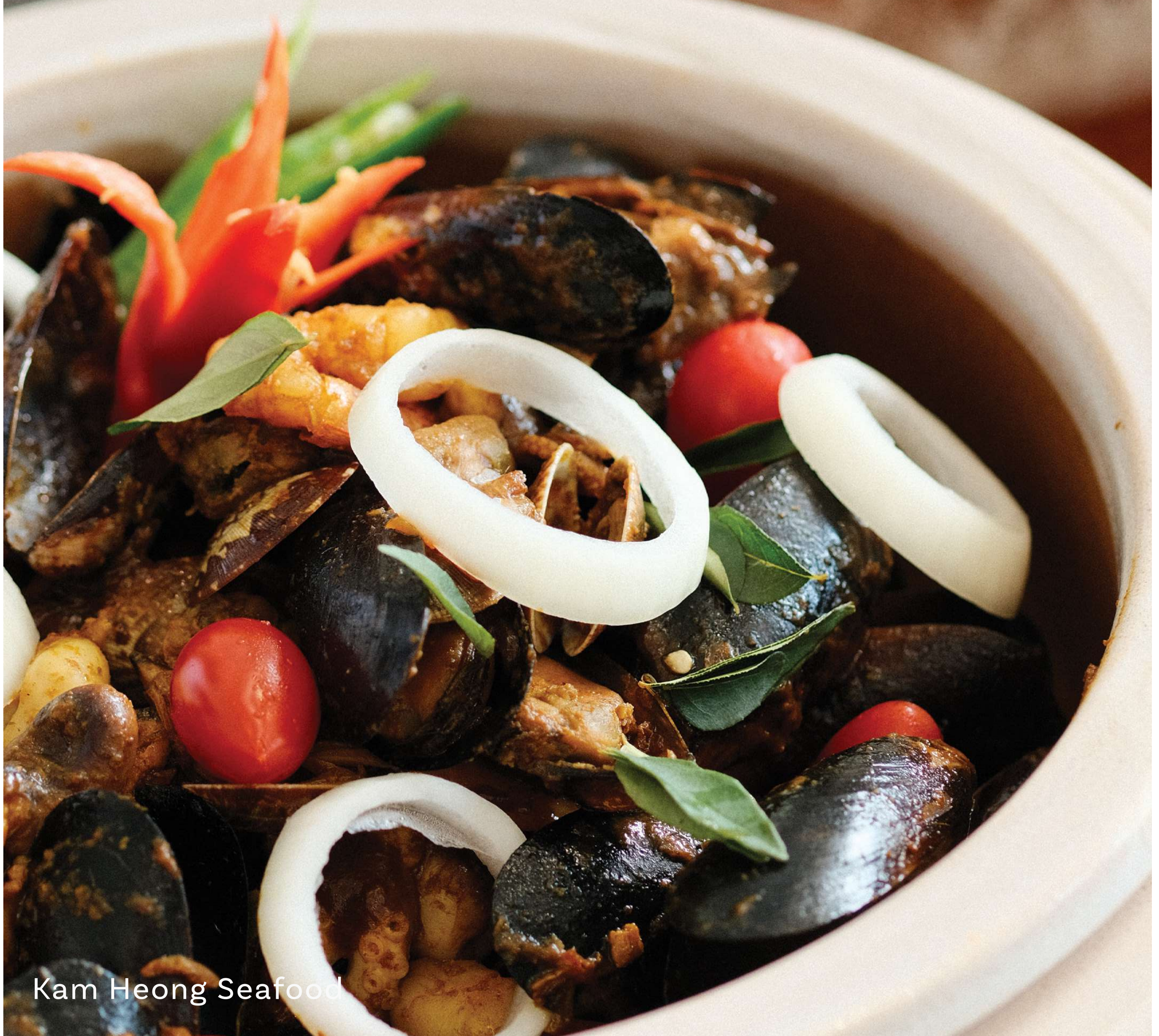
Kam Heong Seafood