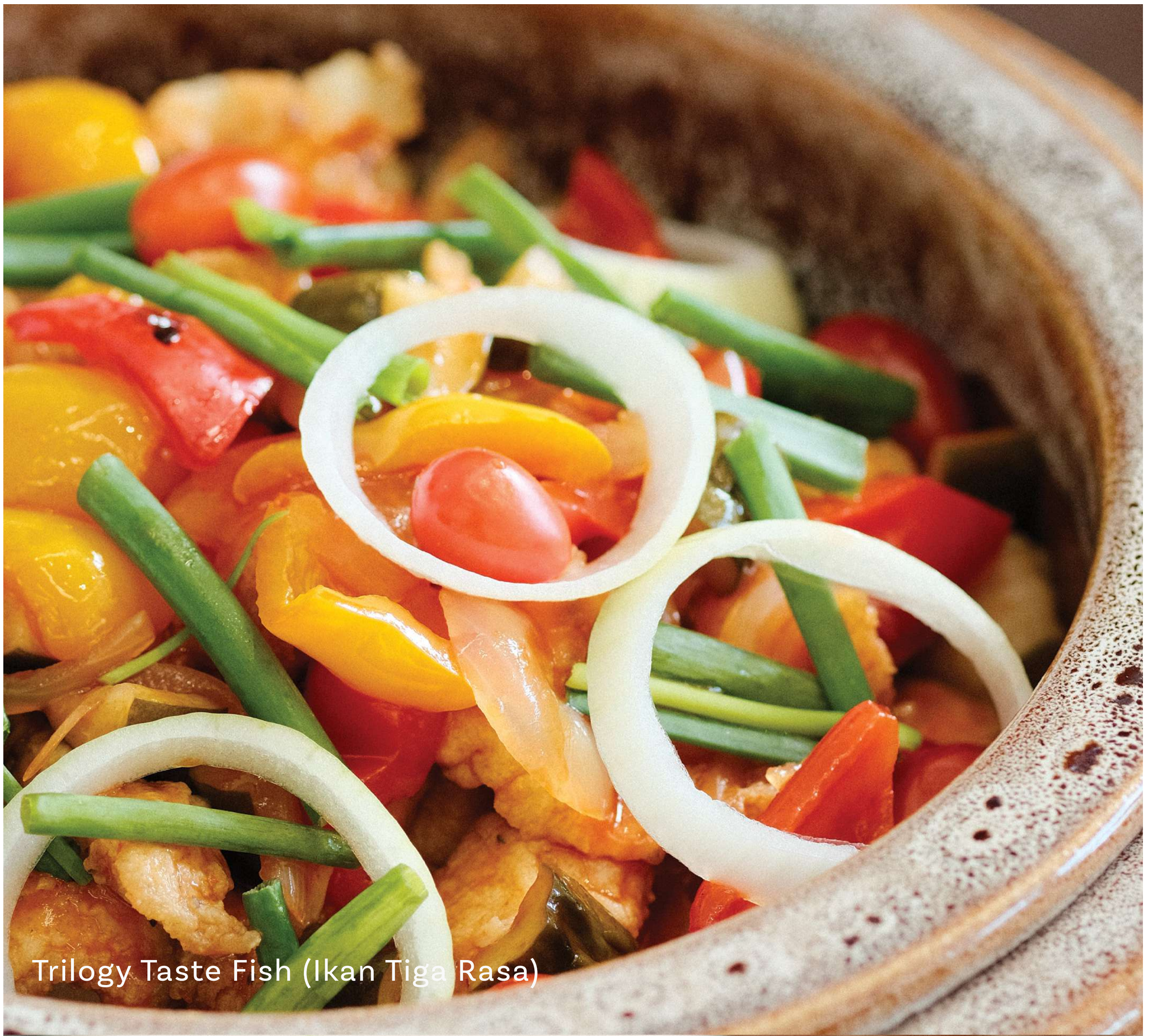
Trilogy Taste Fish (Ikan Tiga Rasa)