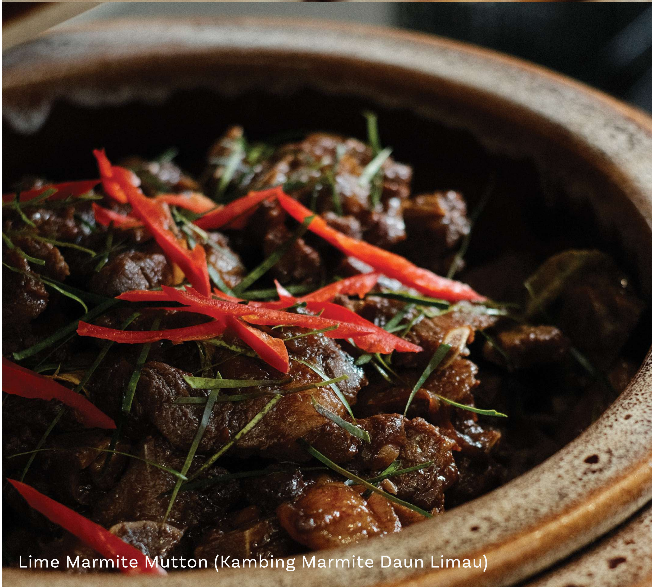
Lime Marmite Mutton (Kambing Marmite Daun Limau)