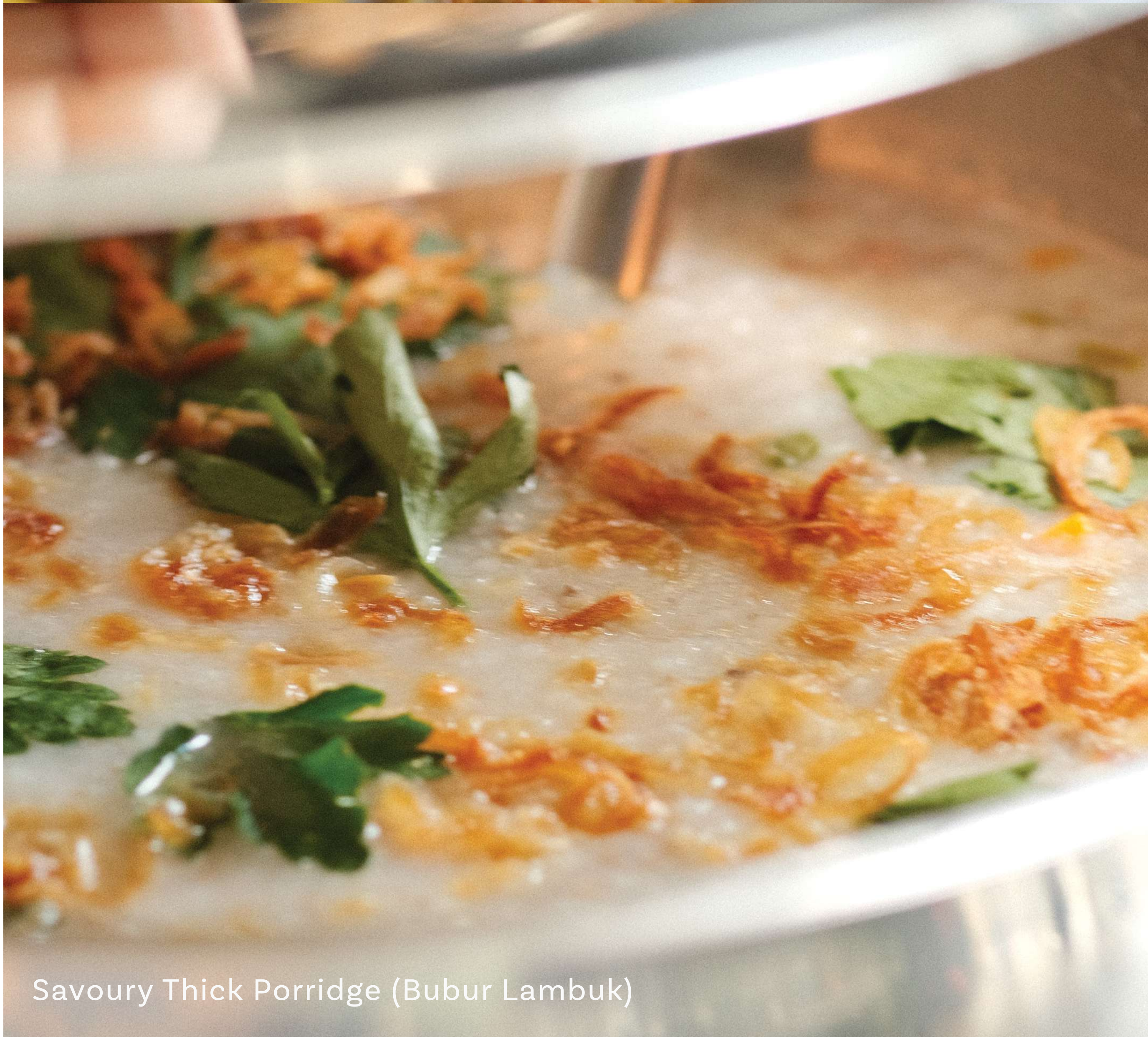
Savoury Thick Porridge (Bubur Lambuk)