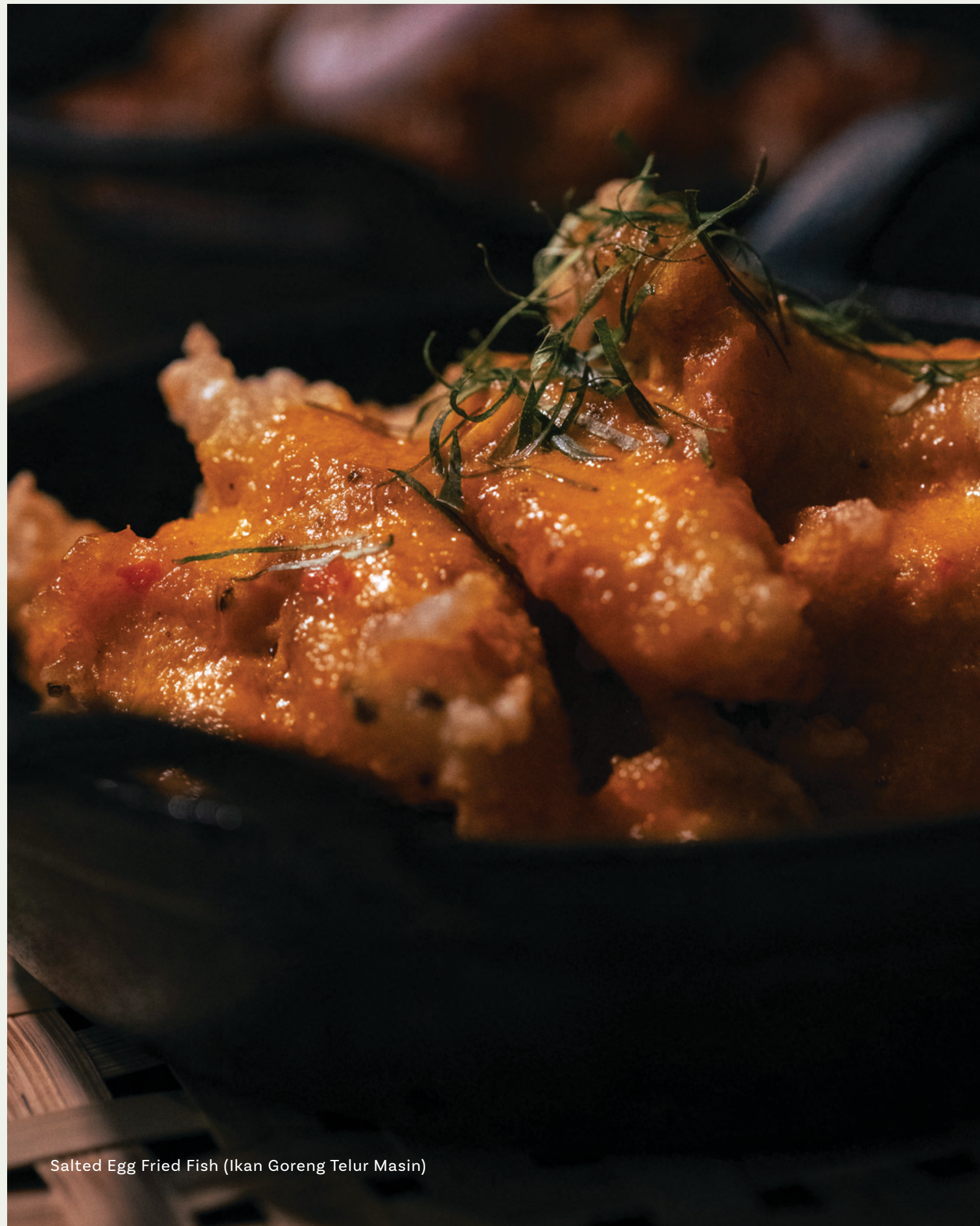
Salted Egg Fried Fish (Ikan Goreng Telur Masin)