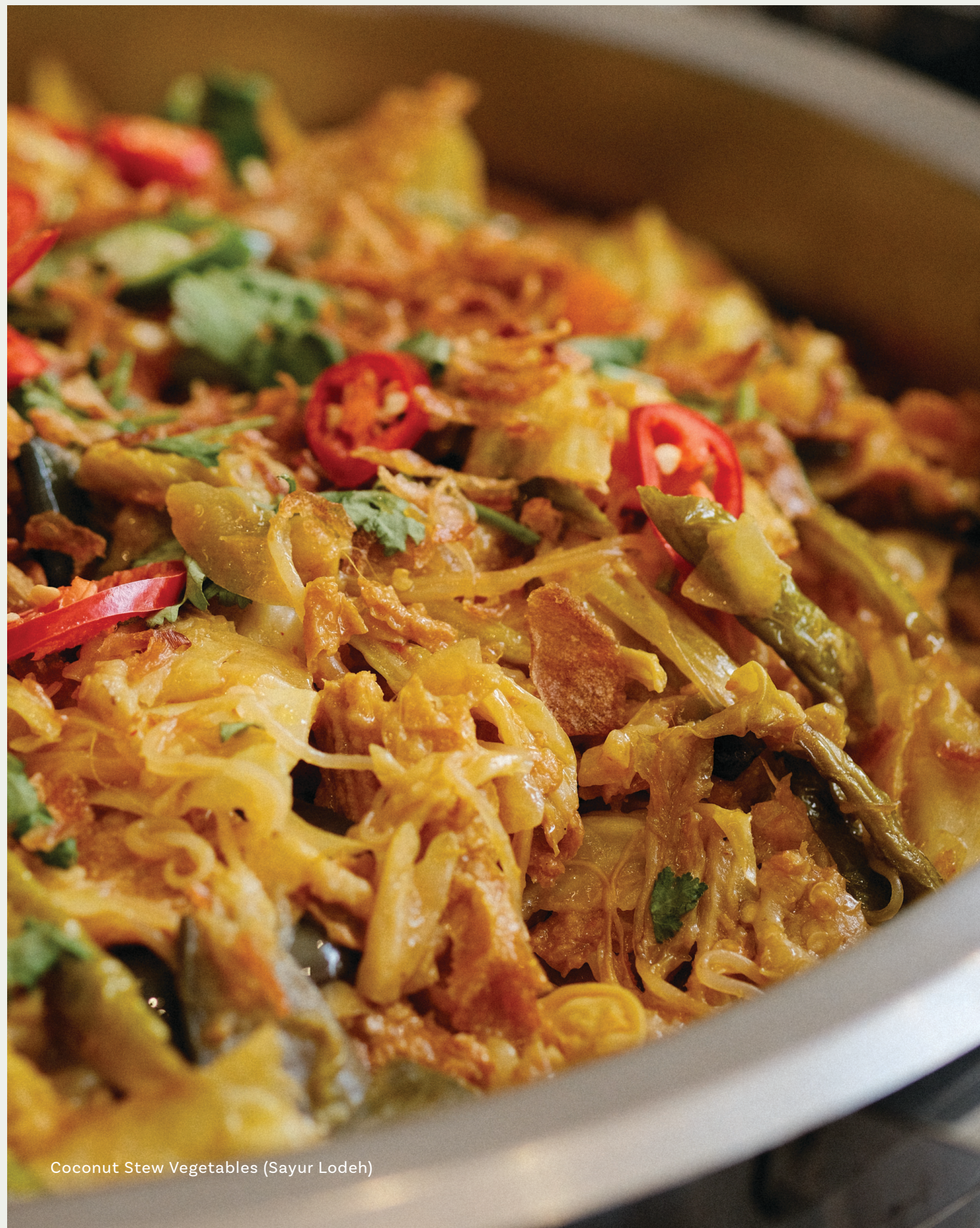
Coconut Stew Vegetables (Sayur Lodeh)