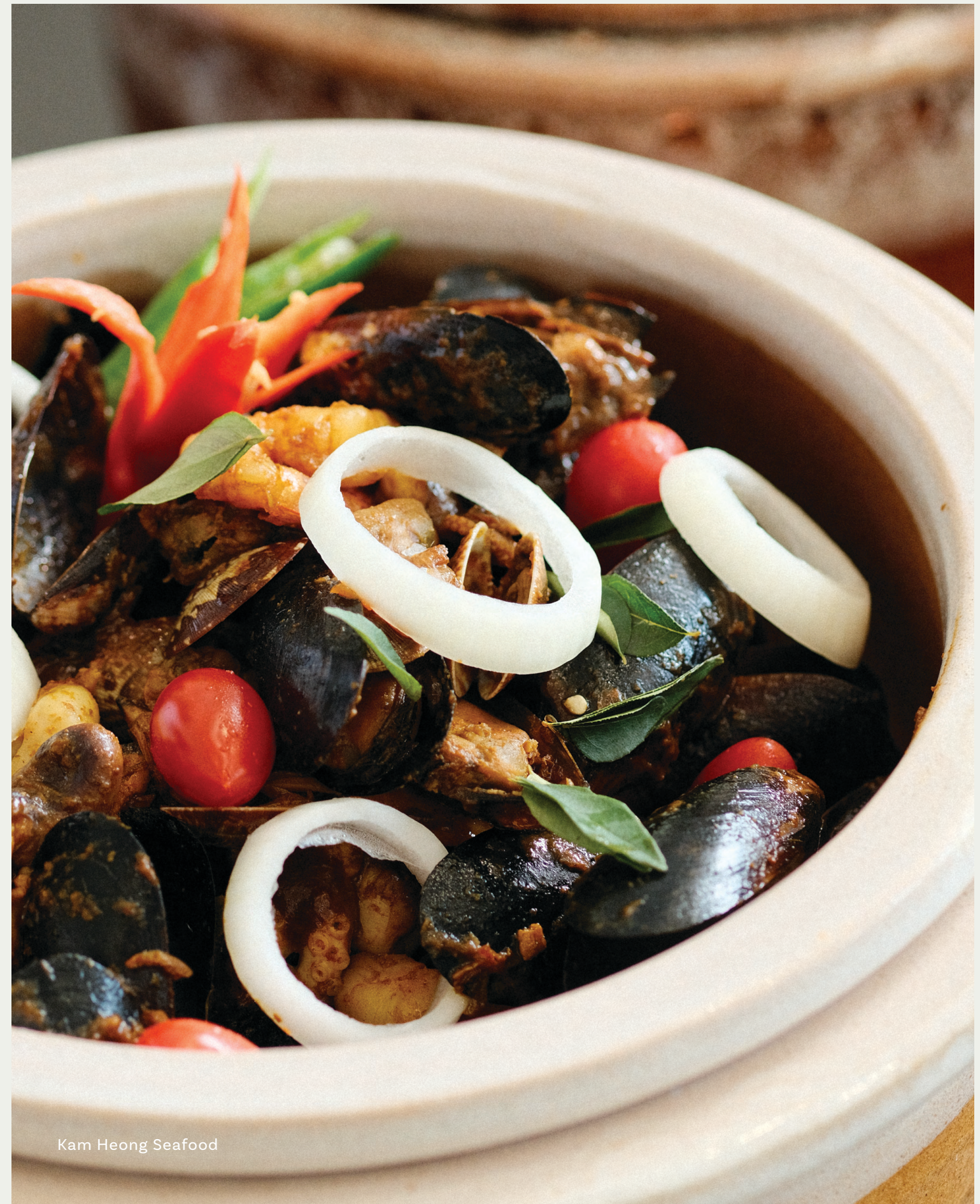
Kam Heong Seafood