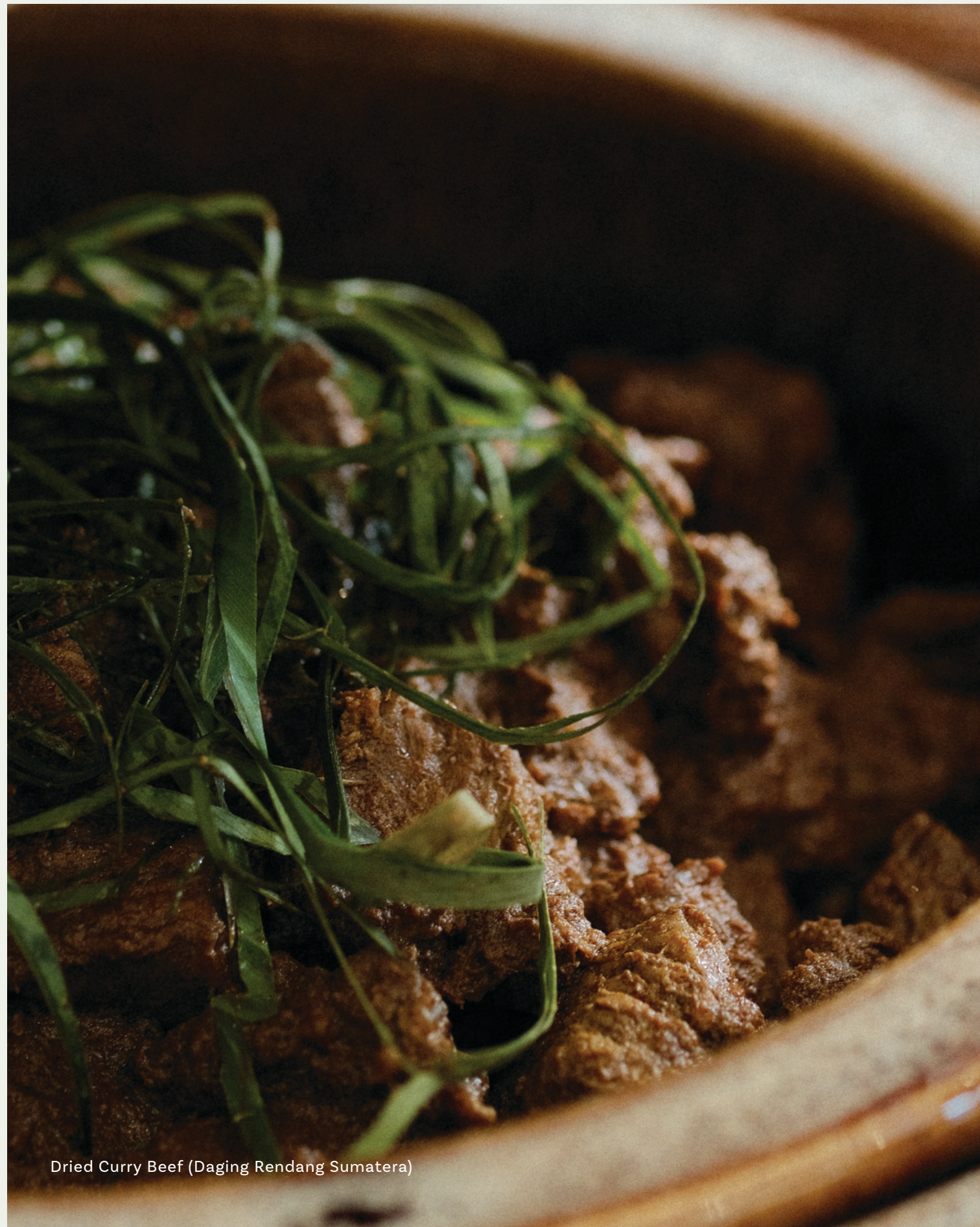
Dried Curry Beef (Daging Rendang Sumatera)