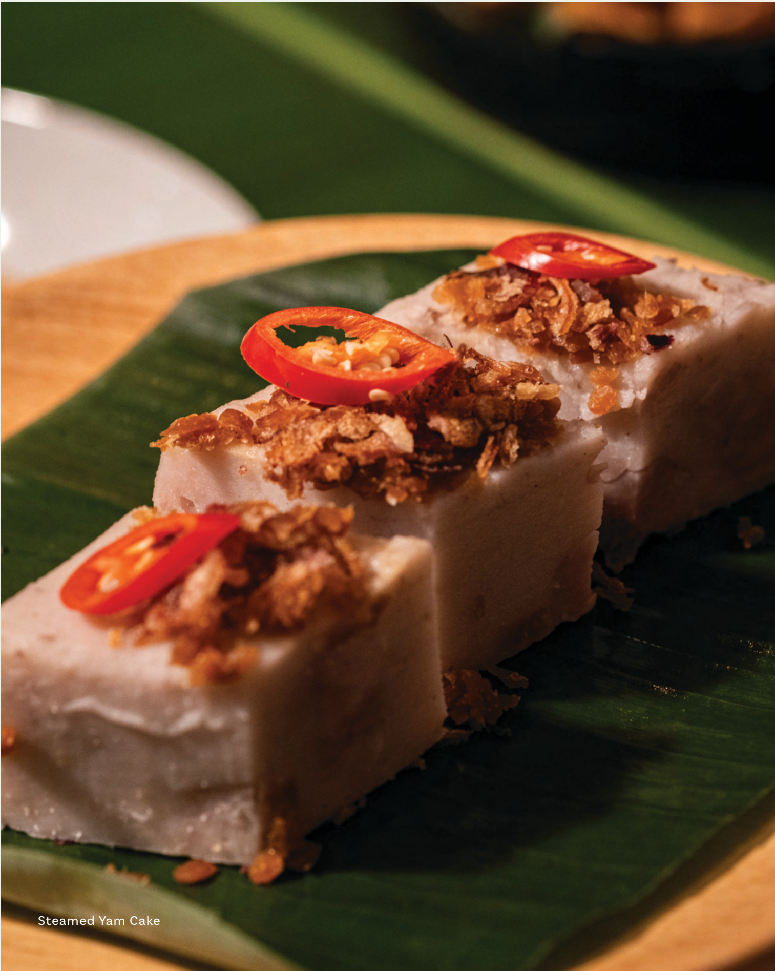
Steamed Yam Cake