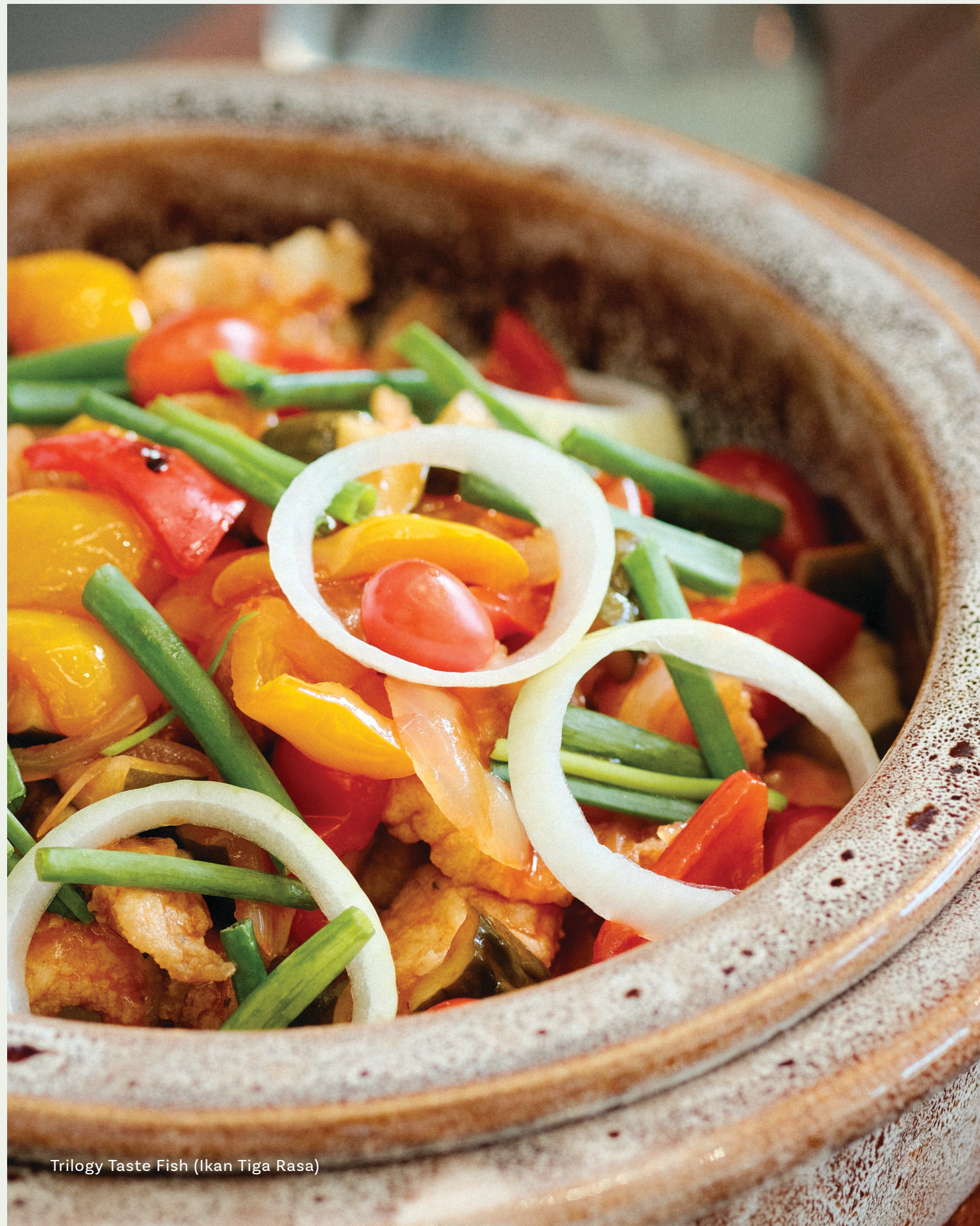
Trilogy Taste Fish (Ikan Tiga Rasa)