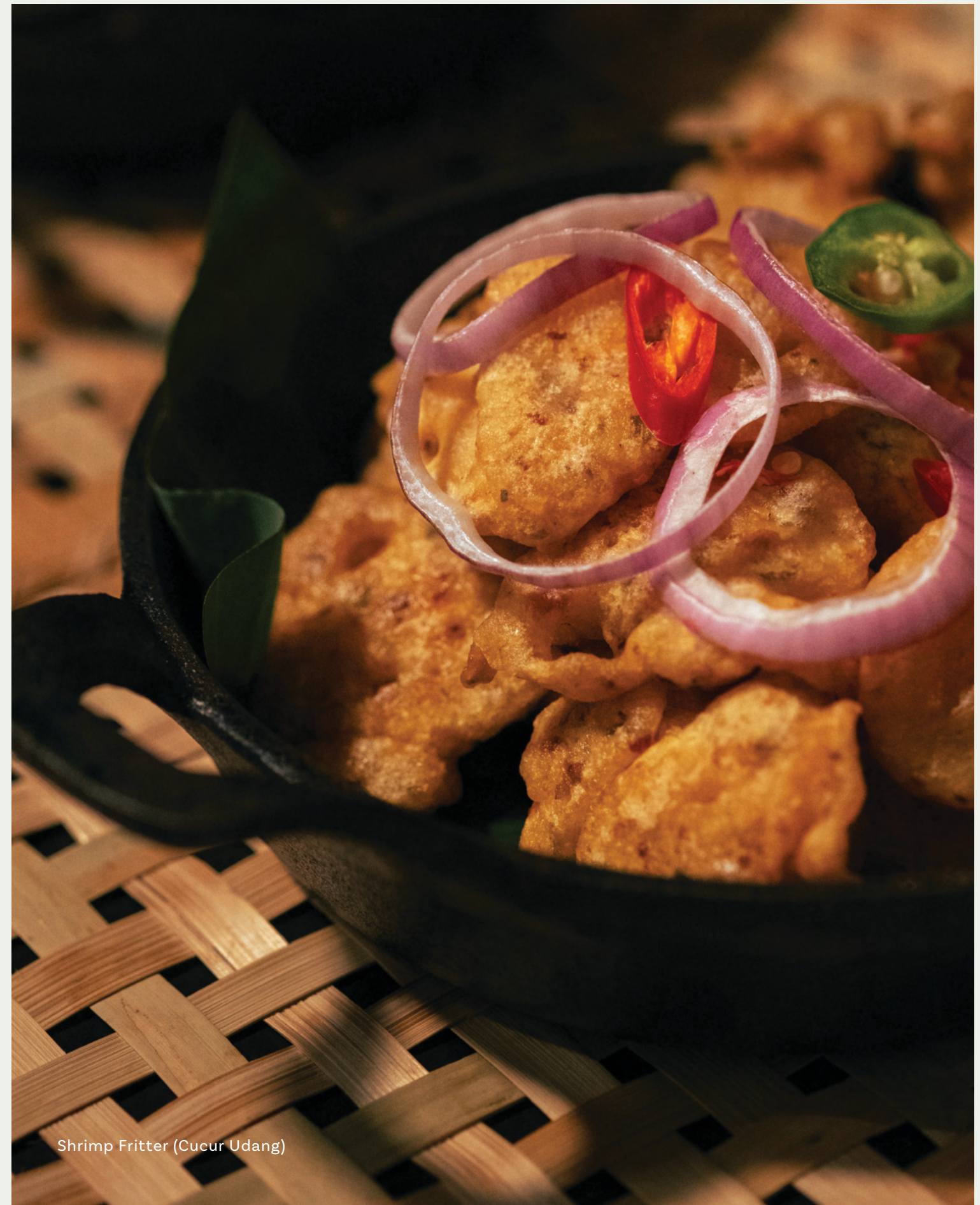
Shrimp Fritter (Cucur Udang)