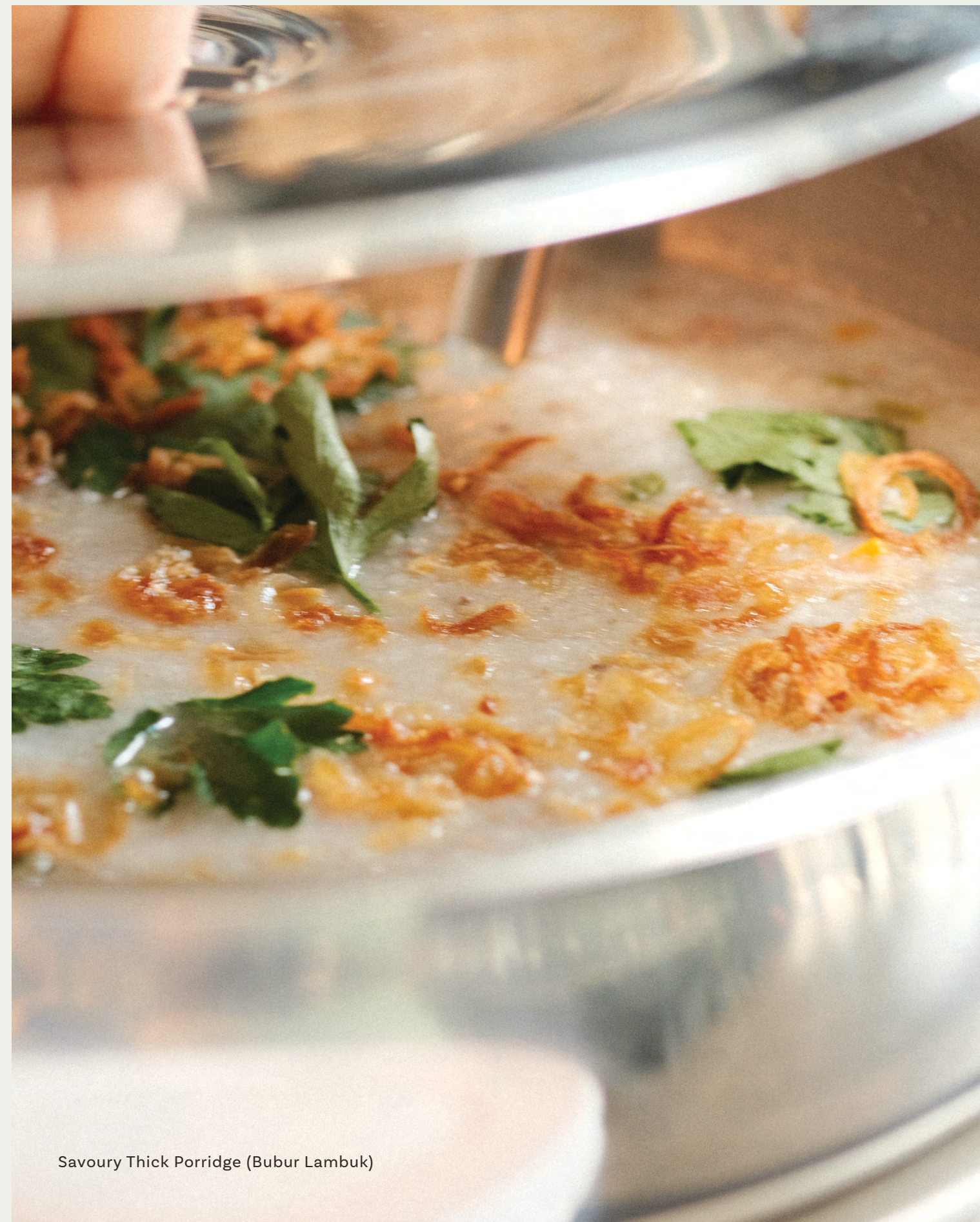
Savoury Thick Porridge (Bubur Lambuk)