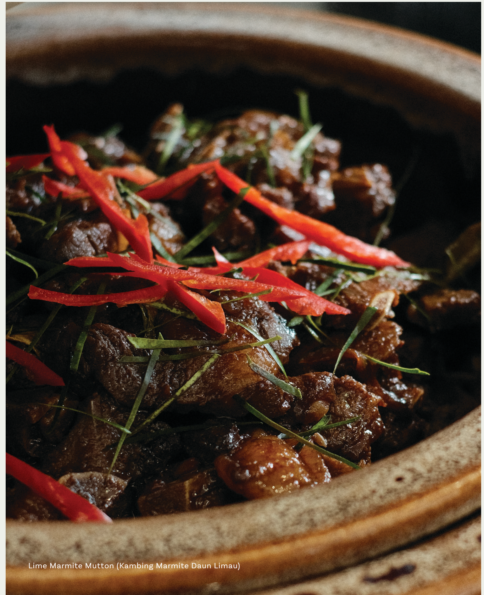
Lime Marmite Mutton (Kambing Marmite Daun Limau)